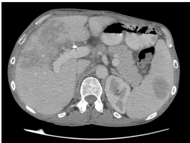
Fig. 1. Abdominal CT in portal venous phase shows hepatosplenomegaly with markedly heterogenous perfusion of the liver and large focal lesion within the spleen.

An abdominal computed tomography (CT) scan demonstrated enlarged and heterogenous liver with disseminated hypovascular focal lesions located in the segments 2, 5, 6 and 8. The spleen was enlarged and contained solid focal lesions suggestive of metastases (fig. 1). Besides, CT demonstrated multiple retroperitoneal and hepatic perihilar lymph nodes 10-13 mm in size. The pancreas was of normal size without focal lesions. An endoscopic retrograde cholangiopancreatography (ERCP) showed stenosis of the hepatic biliary duct at the level of the cystic duct. The intrahepatic biliary ducts were moderately dilated. The plastic stent 10 F 12 cm was inserted through the stenosis. It resulted in a decrease of serum bilirubin level from 4.5 to 0.8 mg/dl.